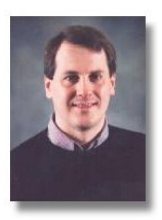
Figure 1—A JPEG image of the author.